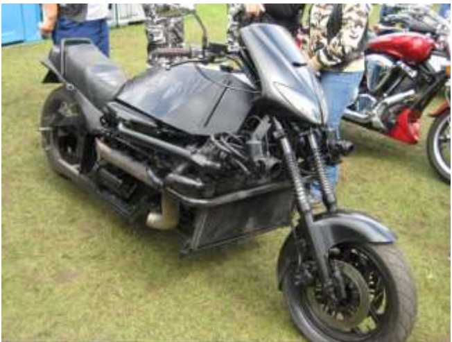
The Brits show those Yanks how it's done! A V12 twist'n'go at a fraction of the price.

Not long now until one of the most friendly, chilled-out rallies on the calendar. "You've Been Nabbed" at Astle Park, Chelford, Cheshire is now in its 24<sup>th</sup> year and is still a proper belter. MAG and NABD have always supported each other, many folks (myself included) being members of both. The MAG stand will be there again this year of course, providing help, advice and a refuge from the weather if needs be.