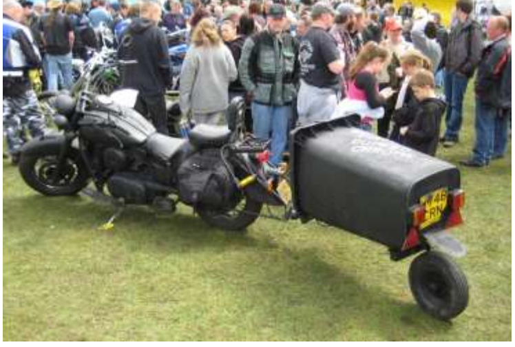
Meeting the latest EU directive on end-of-life: a self-recycling motorcycle.